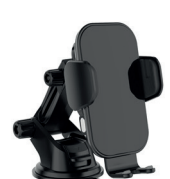
Wireless vehicle charger