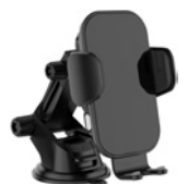
Wireless vehicle charger